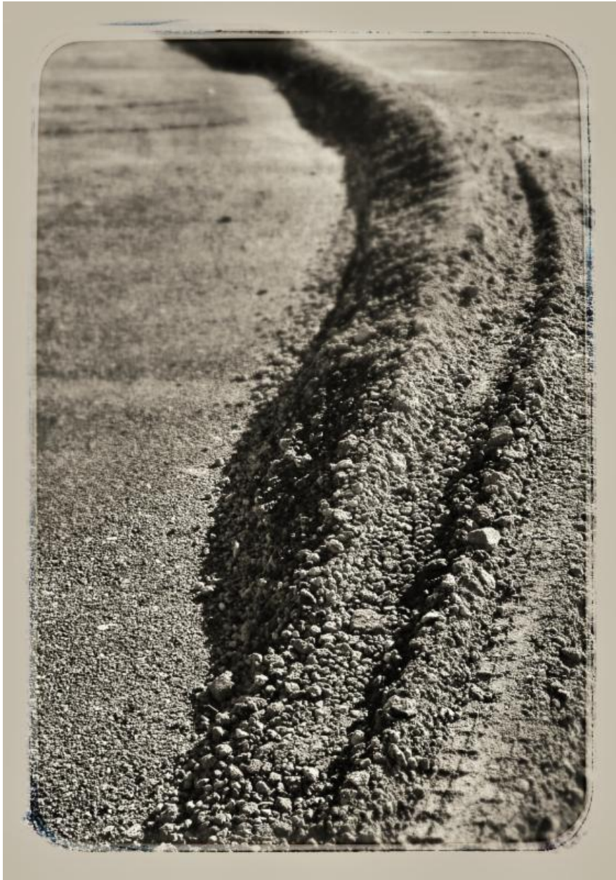
Recycled asphalt closeup

Dan Nourse is a project manager for the Oakland Army Base focusing on environmental remediation, site elevation increase and site surcharging. Dan was instrumental in the redevelopment of Emeryville and West Oakland. He is a self taught photographer and uses photography to capture the progress of redevelopment projects as well as producing artful images along the way.