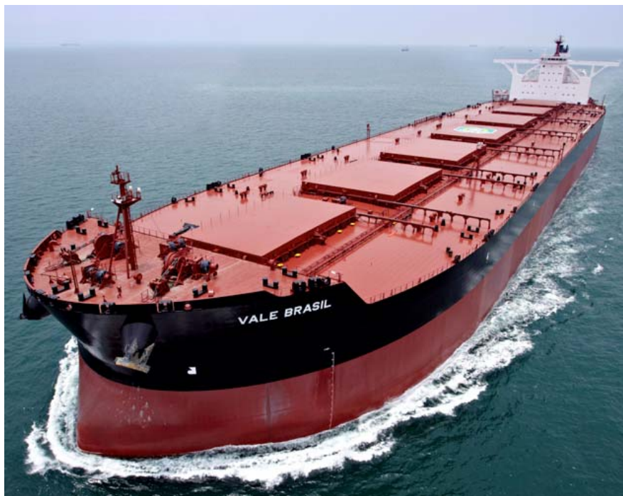
Bulk commodity ship

A new service for the Oakland waterfront